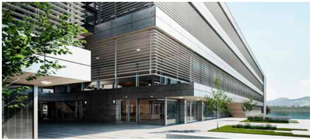
ABB i-bus® KNX is the synonym for smart home and intelligent building control. In this innovative system, all devices communicate with one another via a single bus cable which is installed in addition to the normal power lines. This means that all electrical functions are connected with one another via the bus system, both in residential and commercial buildings.