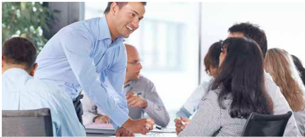
ABB also offers certified Courses.